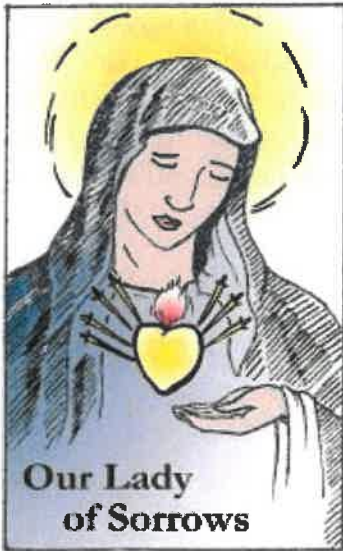
Our Lady of Sorrows