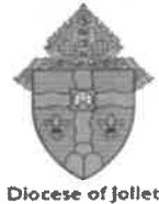
Diocese of Joliet

Parish Goal: $ 10,600.00 Amount Pledged: $ 10,930.00 Amount Paid: $ 10,106.00 2017 Rebate $ 0