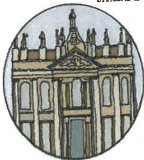
The Dedication of the Lateran Basilica

OUR FALL CARD PARTY WILL BE NOVEMBER 7, 2019 AT 12 NOON HELD AT WILTON CENTER COMMUNITY BUILDING TICKET PACKETS ARE AVAILABLE IN THE VESTIBULE VOLUNTEER SIGN-UP SHEET IS IN VESTIBULE, PLEASE HELP WHERE YOU ARE ABLE