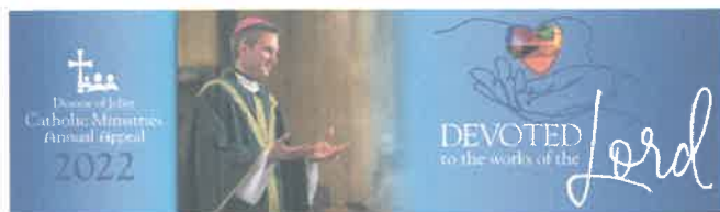
2022 Catholic Ministries Annual Appeal Update (as of 4/24/2022 )