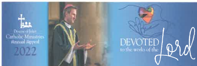
2022 Catholic Ministries Annual Appeal Update (as of 07/24/2022 )