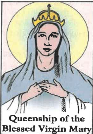
Queenship of the Blessed Virgin Mary