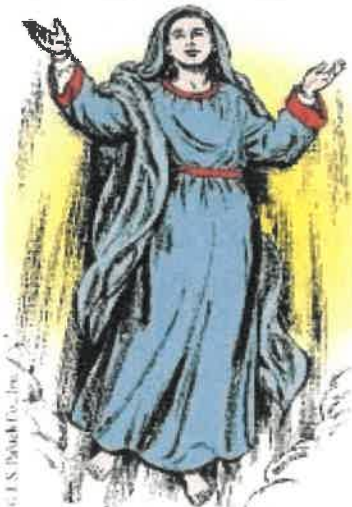
Assumption of the Blessed Virgin Mary

Monday: Ez 1:2-5, 24-28c; Ps 148:1-2, 11-14; Mt 17:22-27 Tuesday: Ez 2:8 -- 3:4; Ps 119:14, 24, 72, 103, 111, 131; Mt 18:1-5, 10, 12-14 Wednesday: Vigil: 1 Chr 15:3-4, 15-16; 16:1-2; Ps 132:6-7, 9-10, 13-14; 1 Cor 15:54b-57; Lk 11:27-28 Day: Rv 11:19a; 12:1-6a, 10ab; Ps 45:10-12, 16; 1 Cor 15:20-27; Lk 1:39-56 Thursday: Ez 12:1-12; Ps 78:56-59, 61-62; Mt 18:21 -- 19:1 Friday: Ez 16:1-15, 60, 63 or 16:59-63; Is 12:2-3, 4bcd-6; Mt 19:3-12 Saturday: Ez 18:1-10, 13b, 30-32; Ps 51:12-15, 18-19; Mt 19:13-15 Sunday: Prv 9:1-6; Ps 34:2-7; Eph 5:15-20; Jn 6:51-58